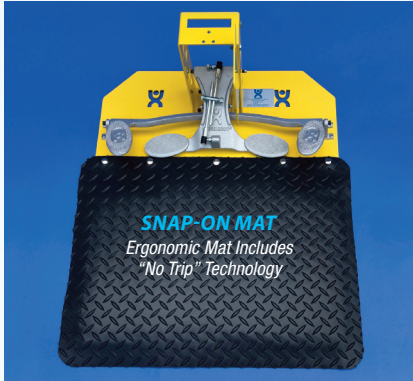
Part # EBS1-A15 (New)

"Simply the best equipment solution in the world for stand up sewing."