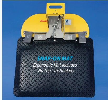
Part # EBS1-B (Bandit)

HEIGHT ..... Mat: 3/4" ..... Tower: 9" WEIGHT ..... 17 lbs. METAL BASE ..... 29.5"L x 22"W STANDING SURFACE ..... 19"L x 22"W OPTIONAL STANDING SURFACE ..... 31"L x 30"W